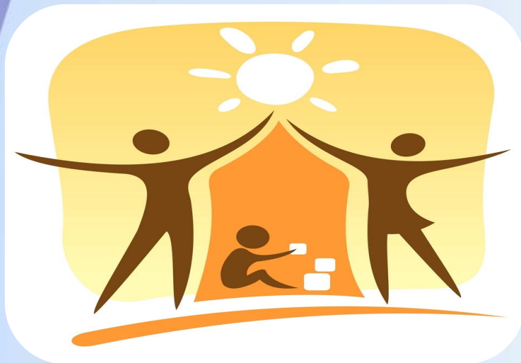
Federal Block Grants